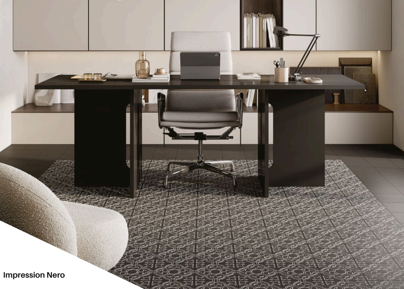
Impression Nero Impression Spice